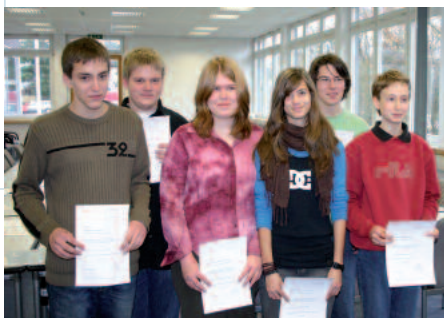
Winners of the Top Tech Stars contest held by the University of Applied Sciences

Research close to life: The Rüsselsheim branch of Wiesbaden University of Applied Sciences advertised its first 'Top Tech Stars' contest for high-school students. On the occasion of the Open House on November 18, twelve entrants from the Immanuel Kant and Max Planck High Schools presented their results. Both visitors and jury members were surprised by the quality of the projects and convinced of the high level of scientific and technical knowhow at the schools by the intelligence and meticulousness of the scientific work.